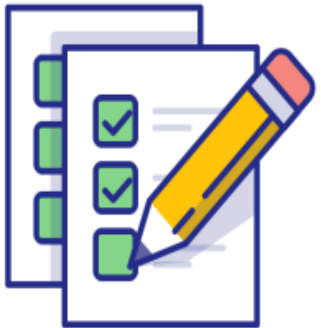
Medical device adverse event reporting form

https://docs.google.com/forms/d/11KyJ7SjBPkvBKeMVNW7pkJprJNBjO4oYSAeJAN64q2U/edit