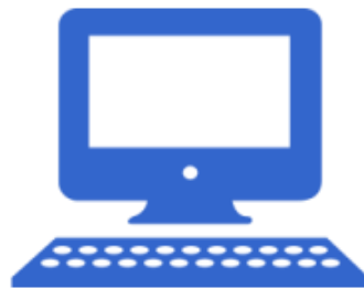
Registered Medical Device Information sharing portal