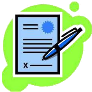
Field Safety Corrective Action form