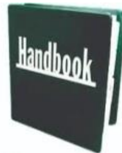
Materiovigilance Hand Book